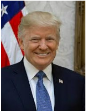
Donald Trump (R)

Arizona (11), Georgia (16), Michigan (15), Nevada (6), North Carolina (16), Pennsylvania (19), Wisconsin (10).