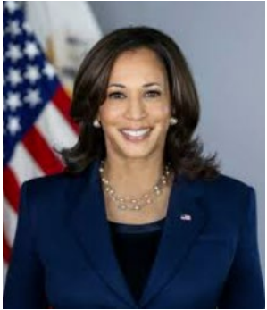
Kamala Harris (D)

Wisconsin's 10 electoral college votes could determine the election.